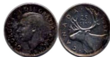
1951 Low Relief 25 cents. Rare.

For more information: GEORGE MANZ COIN AUCTIONS Box 3626 Regina SK S4P 3L7 Canada (306) 352-2337 email: george@georgemanzcoins.com web site: www.georgemanzcoins.com