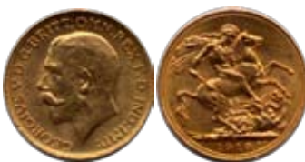
1918C Sovereign. ICCS MS-63.