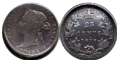
1875H 25 cents. Struck off center. Rare.

George Manz Coin Auctions, the official auctioneer for the 2009 Regina Coin Club Fall Show Western Christian College 4400 Fourth Ave (corner of 4 th Ave & Lewvan Dr Room LR-2 (The Gilbert & Jesse Jacobs Hospitality Room) Regina