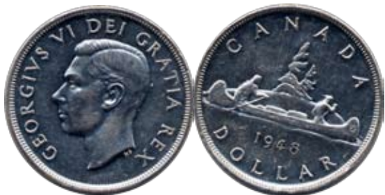
1948 $1 Rotated Dies. ICCS MS-60. Rare.

There is no buyer's fee in this auction.