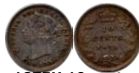
1875H 10 cents. CCCS VF-30. Rare.

Auction & Mail Bid #7, Saturday September 19, 2009.