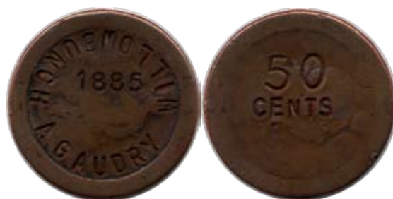
1885 Willow Bunch token. C/S on British 1797 penny. One Known.