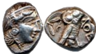
Athens Tetradrachm. 300-262 BC.

Auction & Mail Bid #7, Saturday September 19, 2009.