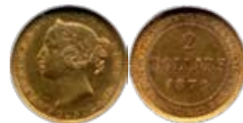
NFLD 1872 $1. NGC AU-58. Scarce.