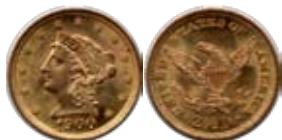
1900 Quarter Eagle. MS-64.